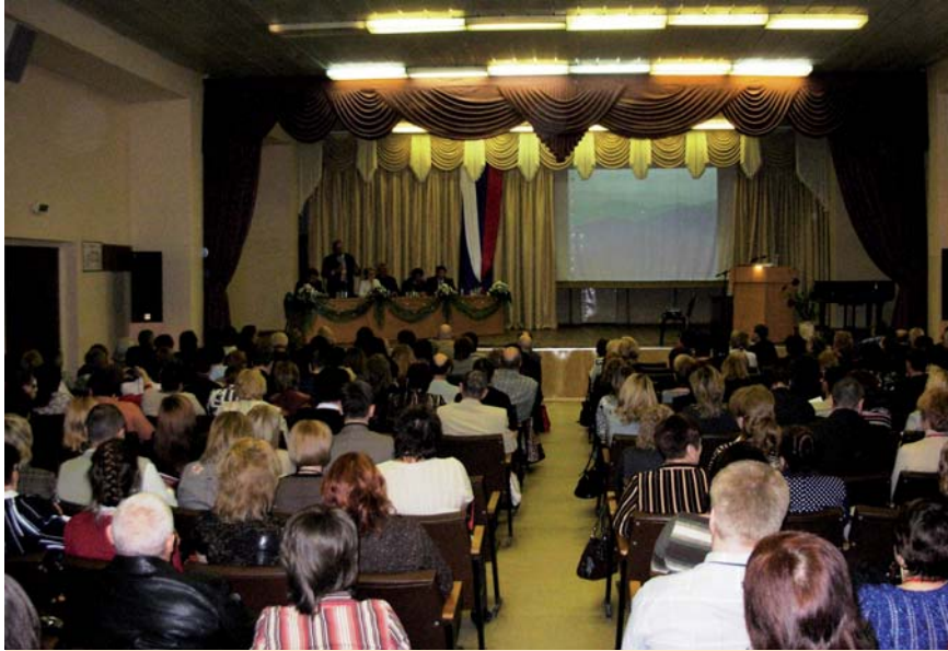
Congress in Chelyabinsk 2008

of the region participate in the district congresses. Every four years the All-Russia congress takes place. The latest was in Moscow two years ago with more than 4,000 doctors participating.