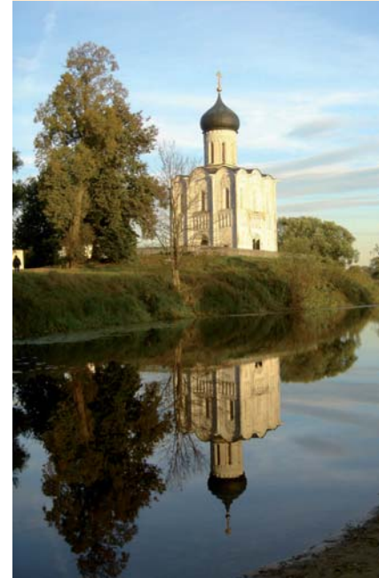
Church of the Protecting Veil of the Mother of God on Nerly

▼ "Have you considered trying to host a EUROSON congress? Moscow would probably be very attractive." "Yes, we considered such an opportunity. Unfortunately an expo-centre available today is surrounded only by very expensive hotels (mainly 5*). Cheaper hotels are located far from expo-